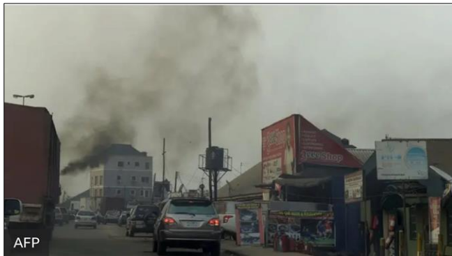
Fig 1: Pupil going to school amidst thick black soot in PortHarcourt